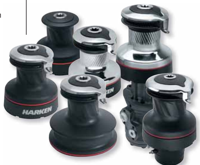
Complete Radial® Line: aluminum and chrome; plain-top and self-tailing; electric and hydraulic; UniPower; Quattro